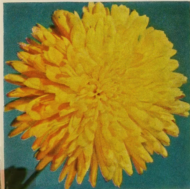
RUTHANN LEHMAN. 60c each; 3 for $1.50